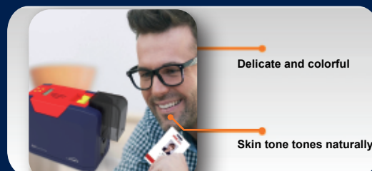
High quality photo processing by Dye sublimation technology

Dual interface card encoding module Contactless ID Card encoding module UHF chip card encoding module Magnetic stripe card encoding module